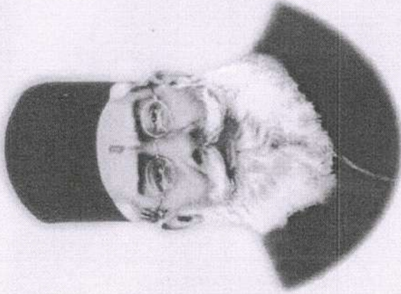
Dr. Balkrishna Shivram Moonje Founder

Bhonsala Institute of Nursing Rambhoomi, Dr. Moonje Marg, Nashik - 422 005.