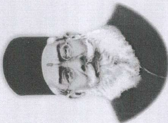
Dr. Balkrishna Shivram Moonje Founder

Bhonsala Institute of Nursing Dr. Moonje Marg, Rambhoomi, Nashik