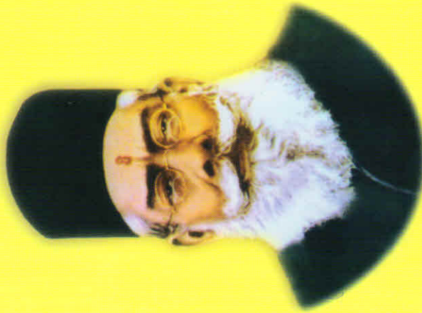
Dr. Balkrishna Shivram Moonje Founder