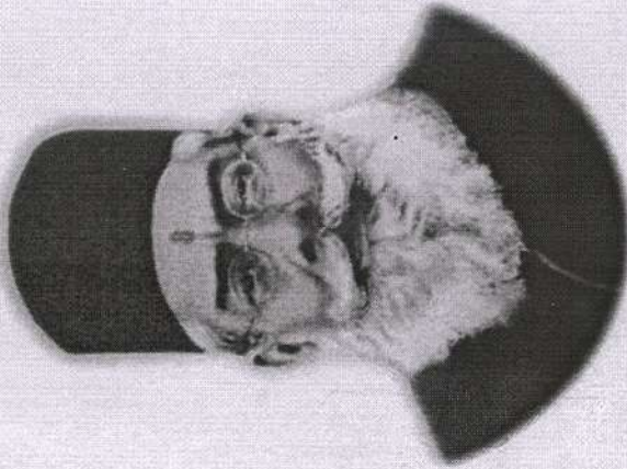
Dr. Balkrishna Shivram Moonje Founder